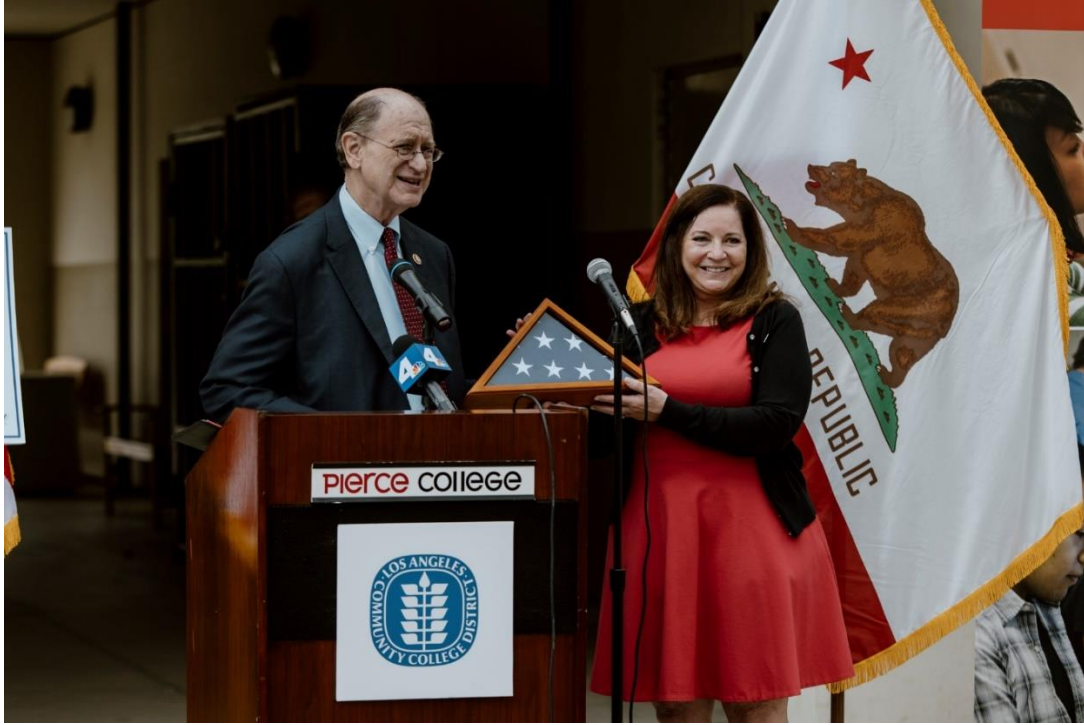
Los Angeles Pierce College (LAPC) Community Engagement & Enrichment Center: U.S. Representative Brad Sherman (D-CA-32) requested $850,000 for LAPC for the creation of a Community Engagement and Enrichment Center at the College Arboretum. (Status TBD)