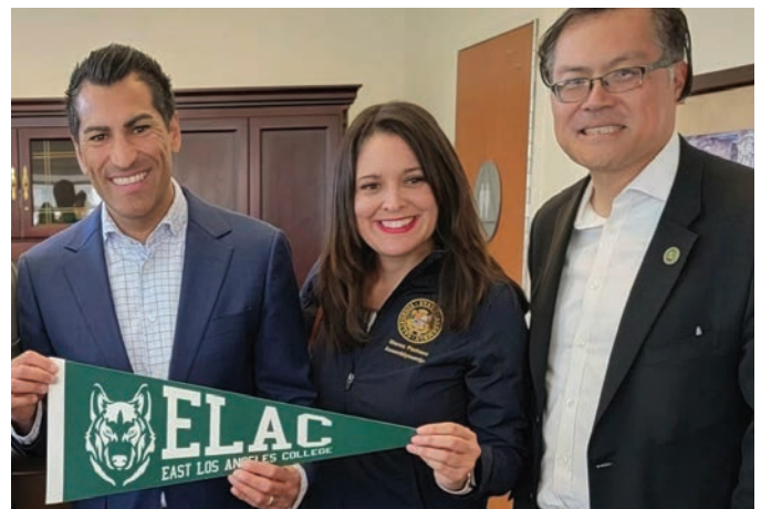
Speaker of the Assembly Robert Rivas (AD-29) with Assemblymembers Mike Fong (AD-49) and Blanca Pacheco (AD-64)

$3.9 Million was allocated in The Budget Act for Student Basic Needs. Statewide Budget Request. AB 74 (Ting) Budget Act of 2019. Chapter 23, Section 12 of Article IV of the California Constitution.