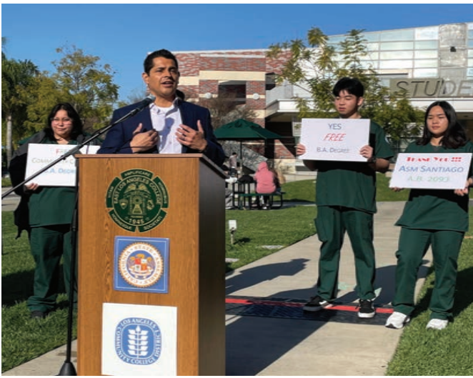
Assemblymember Miguel Santiago (AD-54) with ELAC Students