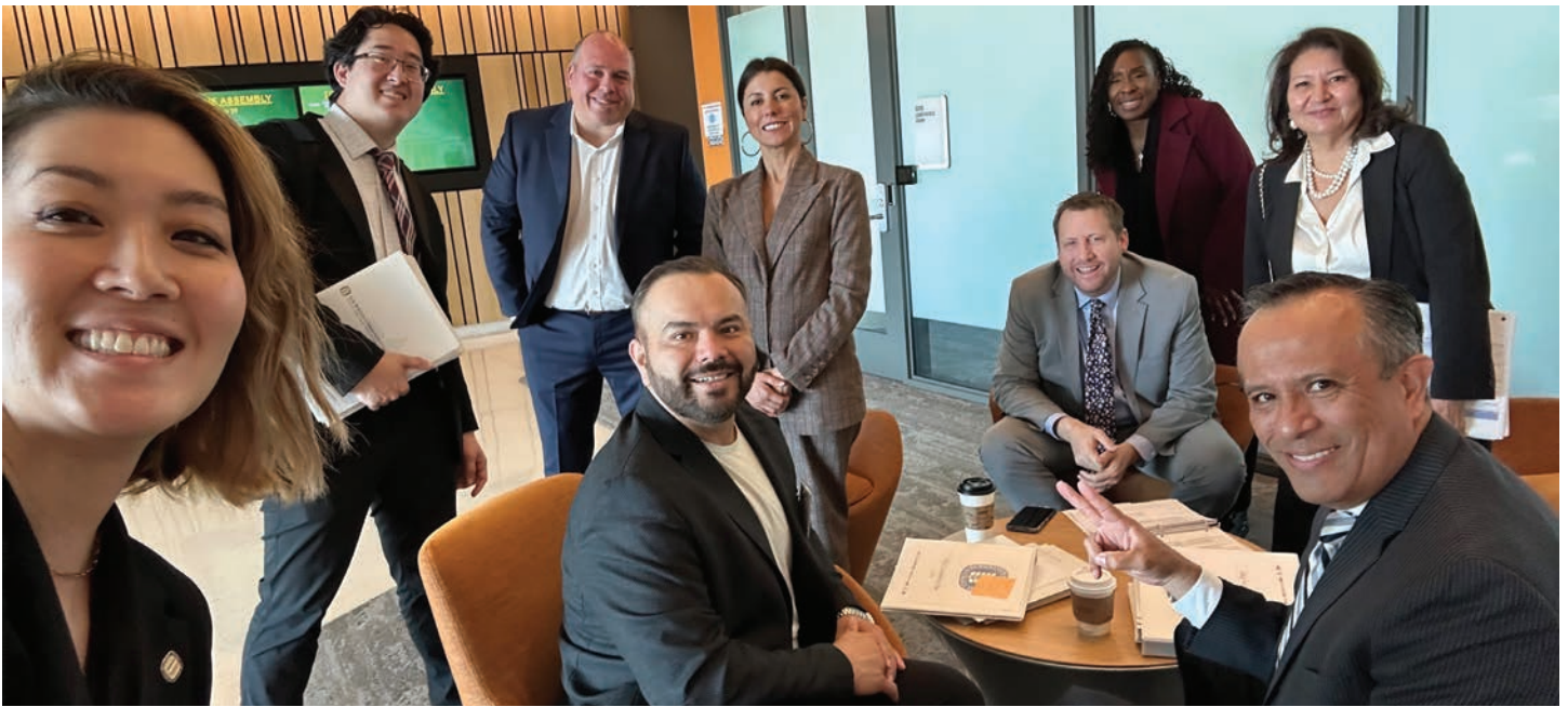
Los Angeles Community College District Trustees with LACCD 2024 Advocacy Team

The bill was passed and signed into law by Governor Jerry Brown on September 12, 2016. Chapter 299, Statutes of 2017.