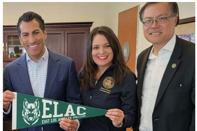
Speaker of the Assembly Robert Rivas (AD-29) with Assemblymembers Mike Fong (AD-49) and Blanca Pacheco (AD-64)

$3.9 Million was allocated in The Budget Act for Student Basic Needs. Statewide Budget Request. AB 74 (Ting) Budget Act of 2019. Chapter 23, Section 12 of Article IV of the California Constitution.