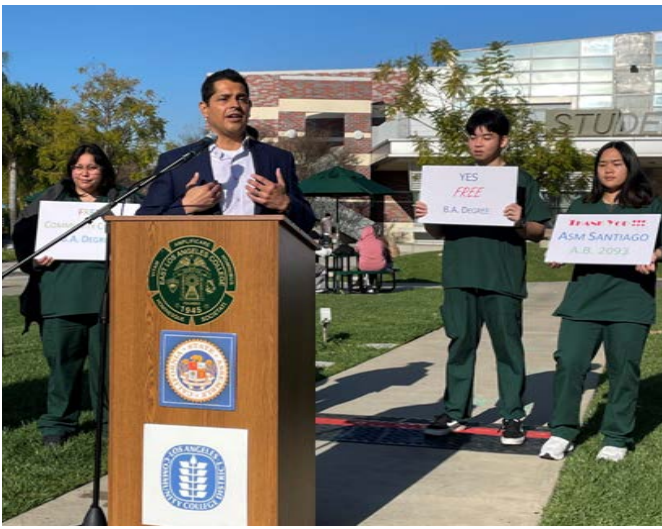
Assemblymember Miguel Santiago (AD-54) with ELAC Students