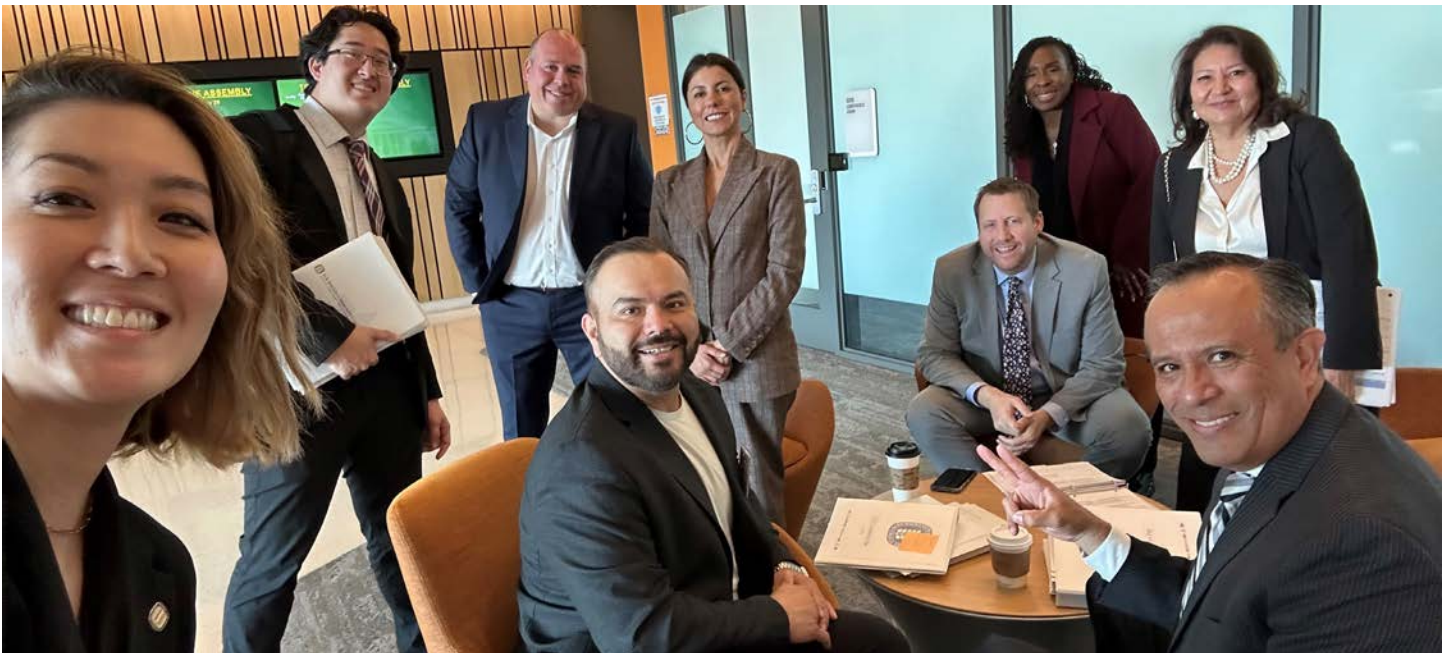
Los Angeles Community College District Trustees with LACCD 2024 Advocacy Team

The bill was passed and signed into law by Governor Jerry Brown on September 12, 2016. Chapter 299, Statutes of 2017.